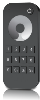
BD1210R8 8 zone dimming

8 zone dimming, touch wheel, wireless remote 30 m distance, AAAx2 battery, Magnet stuck fix